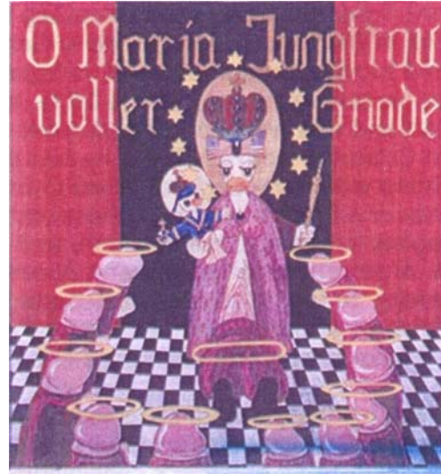
Father, Father, why Hate You Forsaken Me! and Oh Mary, Full of Grace 1990 acrylic on glass, 47 x 431n.